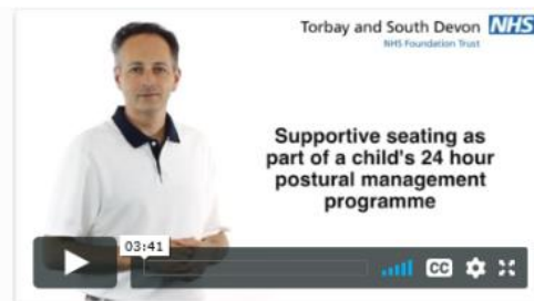
Supportive seating as part of a child's 24 hour postural management plan