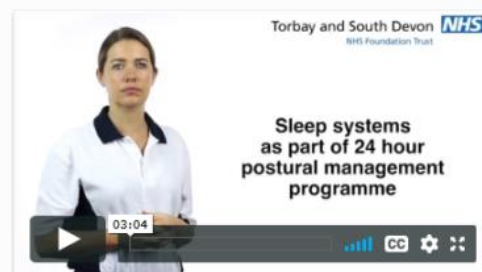
Supportive lying as part of a child's 24 hour postural management plan