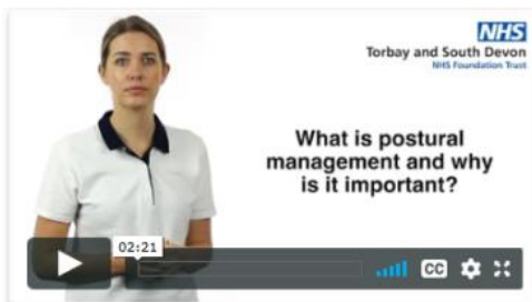
What is 24 hour postural management and why is it important?

Click the link- https://www.torbayandsouthdevon.nhs.uk/services/physiotherapy/support-videos/postural-management/